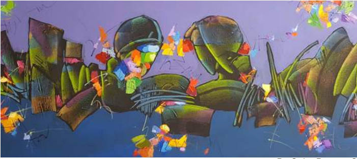
By Saim Dursun ©

Born in Elazığ on the east of Turkey, Saim Dursun, depicts, with the warm liveliness of light and color on his spatula, the true Anatolian picture uncovering the strong willpower of Turkish people and their joy of life despite hardship. Painter Saim Dursun passed away in August 13, 2021 at the age of 62.