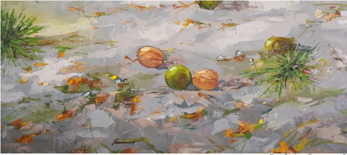
By Saim Dursun ©

Born in Elazığ on the east of Turkey, Saim Dursun, depicts, with the warm liveliness of light and color on his spatula, the true Anatolian picture uncovering the strong willpower of Turkish people and their joy of life despite hardship. Painter Saim Dursun passed away in August 13, 2021 at the age of 62.