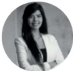
By Irem Girenes Yucesoy