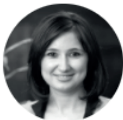
By Mutlu Yildirim Köse