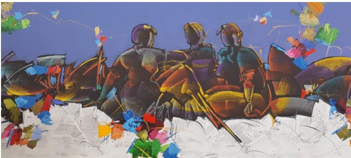
By Saim Dursun ©

Born in Elazığ on the east of Turkey, Saim Dursun, depicts, with the warm liveliness of light and color on his spatula, the true Anatolian picture uncovering the strong willpower of Turkish people and their joy of life despite hardship. Painter Saim Dursun passed away in August 13, 2021 at the age of 62.