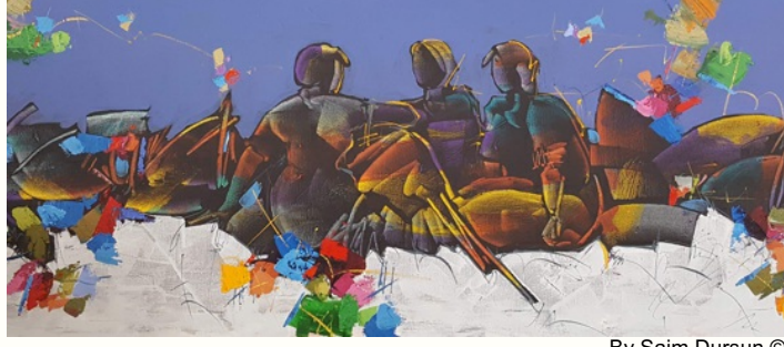
By Saim Dursun ©

Born in Elazığ on the east of Turkey, Saim Dursun, depicts, with the warm liveliness of light and color on his spatula, the true Anatolian picture uncovering the strong willpower of Turkish people and their joy of life despite hardship. Painter Saim Dursun passed away in August 13, 2021 at the age of 62.