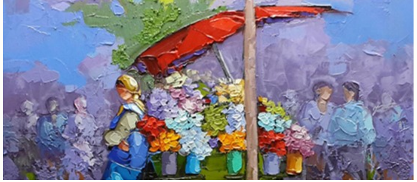
By Saim Dursun ©

Born in Elazığ on the east of Turkey, Saim Dursun, depicts, with the warm liveliness of light and color on his spatula, the true Anatolian picture uncovering the strong willpower of Turkish people and their joy of life despite hardship.