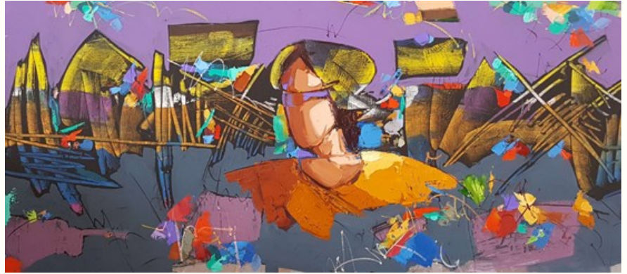
By Saim Dursun ©

Born in Elazığ on the east of Turkey, Saim Dursun, depicts, with the warm liveliness of light and color on his spatula, the true Anatolian picture uncovering the strong willpower of Turkish people and their joy of life despite hardship. Painter Saim Dursun passed away in August 13, 2021 at the age of 62.