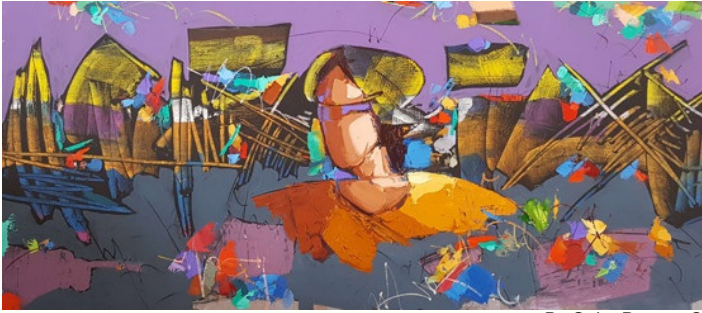
By Saim Dursun ©

Born in Elaziğ on the east of Turkey, Saim Dursun, depicts, with the warm liveliness of light and color on his spatula, the true Anatolian picture uncovering the strong willpower of Turkish people and their joy of life despite hardship. Painter Saim Dursun passed away in August 13, 2021 at the age of 62.