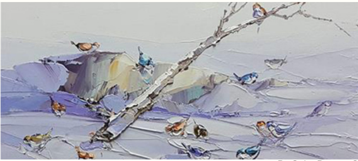
By Saim Dursun ©

Born in Elazığ on the east of Turkey, Saim Dursun, depicts, with the warm liveliness of light and color on his spatula, the true Anatolian picture uncovering the strong willpower of Turkish people and their joy of life despite hardship. Painter Saim Dursun passed away in August 13, 2021 at the age of 62.