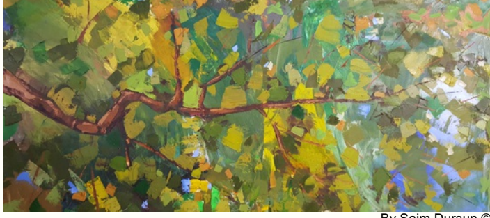
By Saim Dursun ©

Born in Elazığ on the east of Turkey, Saim Dursun, depicts, with the warm liveliness of light and color on his spatula, the true Anatolian picture uncovering the strong willpower of Turkish people and their joy of life despite hardship. Painter Saim Dursun passed away in August 13, 2021 at the age of 62.