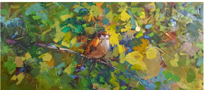
By Saim Dursun ©

Born in Elaziğ on the east of Turkey, Saim Dursun, depicts, with the warm liveliness of light and color on his spatula, the true Anatolian picture uncovering the strong willpower of Turkish people and their joy of life despite hardship. Painter Saim Dursun passed away in August 13, 2021 at the age of 62.