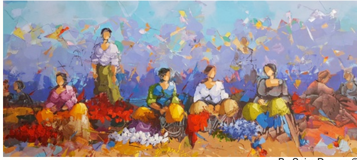
By Saim Dursun ©

Born in Elaziğ on the east of Turkey, Saim Dursun, depicts, with the warm liveliness of light and color on his spatula, the true Anatolian picture uncovering the strong willpower of Turkish people and their joy of life despite hardship. Painter Saim Dursun passed away in August 13, 2021 at the age of 62.