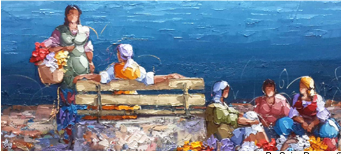
By Saim Dursun ©

Born in Elazığ on the east of Turkey, Saim Dursun, depicts, with the warm liveliness of light and color on his spatula, the true Anatolian picture uncovering the strong willpower of Turkish people and their joy of life despite hardship. Painter Saim Dursun passed away in August 13, 2021 at the age of 62.