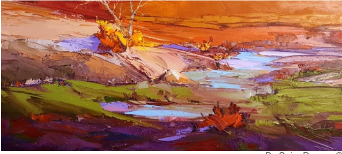
By Saim Dursun ©

Born in Elazığ on the east of Turkey, Saim Dursun, depicts, with the warm liveliness of light and color on his spatula, the true Anatolian picture uncovering the strong willpower of Turkish people and their joy of life despite hardship. Painter Saim Dursun passed away in August 13, 2021 at the age of 62.