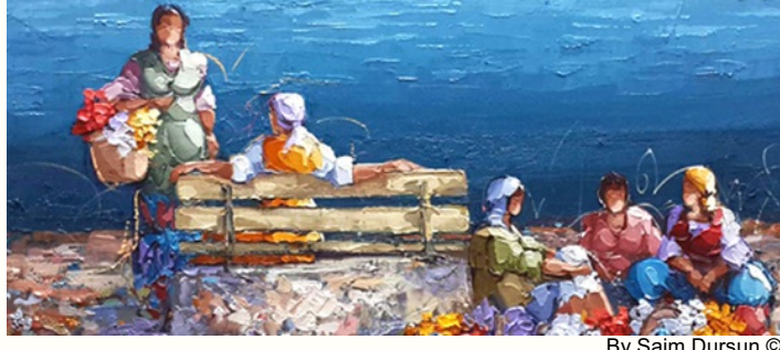
By Saim Dursun ©

Born in Elazığ on the east of Turkey, Saim Dursun, depicts, with the warm liveliness of light and color on his spatula, the true Anatolian picture uncovering the strong willpower of Turkish people and their joy of life despite hardship. Painter Saim Dursun passed away in August 13, 2021 at the age of 62.