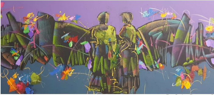
By Saim Dursun ©

Born in Elazığ on the east of Turkey, Saim Dursun, depicts, with the warm liveliness of light and color on his spatula, the true Anatolian picture uncovering the strong willpower of Turkish people and their joy of life despite hardship. Painter Saim Dursun passed away in August 13, 2021 at the age of 62.