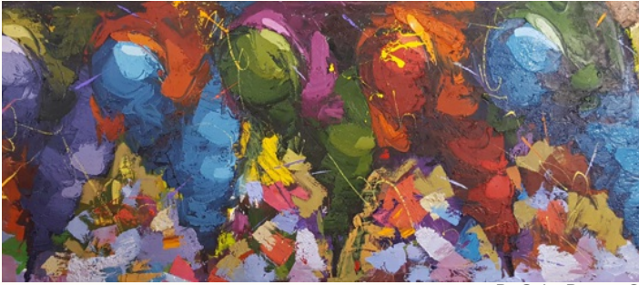
By Saim Dursun ©

Born in Elazığ on the east of Turkey, Saim Dursun, depicts, with the warm liveliness of light and color on his spatula, the true Anatolian picture uncovering the strong willpower of Turkish people and their joy of life despite hardship. Painter Saim Dursun passed away in August 13, 2021 at the age of 62.