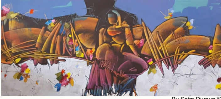
By Saim Dursun ©

Born in Elazığ on the east of Turkey, Saim Dursun, depicts, with the warm liveliness of light and color on his spatula, the true Anatolian picture uncovering the strong willpower of Turkish people and their joy of life despite hardship. Painter Saim Dursun passed away in August 13, 2021 at the age of 62.