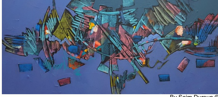
By Saim Dursun ©

Born in Elazığ on the east of Turkey, Saim Dursun, depicts, with the warm liveliness of light and color on his spatula, the true Anatolian picture uncovering the strong willpower of Turkish people and their joy of life despite hardship. Painter Saim Dursun passed away in August 13, 2021 at the age of 62.