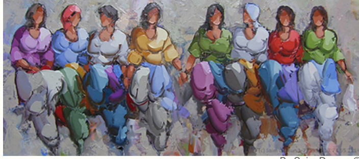
By Saim Dursun ©

Born in Elazığ on the east of Turkey, Saim Dursun, depicts, with the warm liveliness of light and color on his spatula, the true Anatolian picture uncovering the strong willpower of Turkish people and their joy of life despite hardship. Painter Saim Dursun passed away in August 13, 2021 at the age of 62.