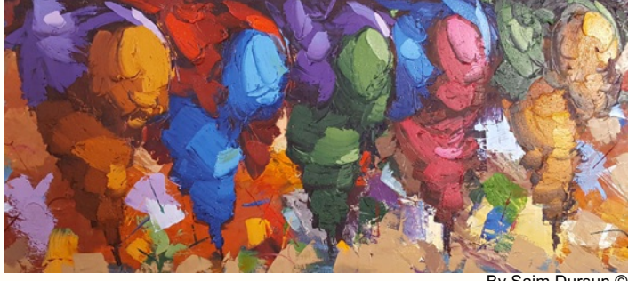
By Saim Dursun ©

Born in Elazığ on the east of Turkey, Saim Dursun, depicts, with the warm liveliness of light and color on his spatula, the true Anatolian picture uncovering the strong willpower of Turkish people and their joy of life despite hardship. Painter Saim Dursun passed away in August 13, 2021 at the age of 62.